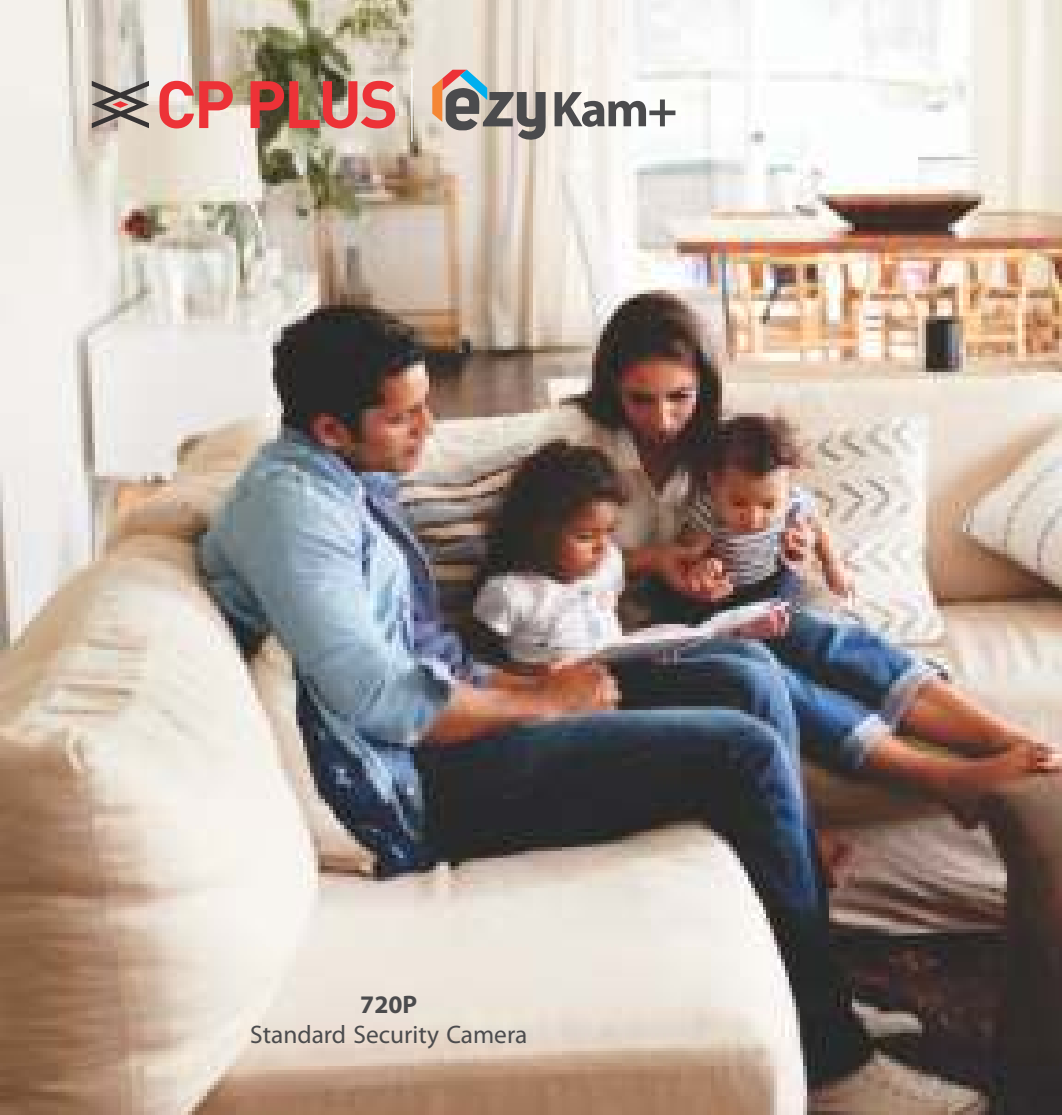
720P Standard Security Camera