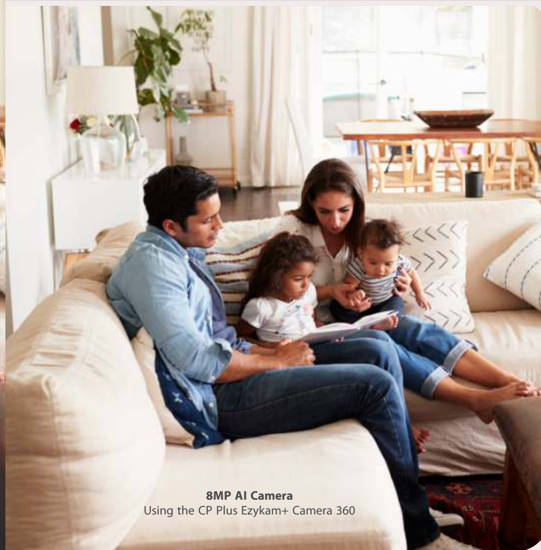
8MP AI Camera Using the CP Plus Ezykam+ Camera 360