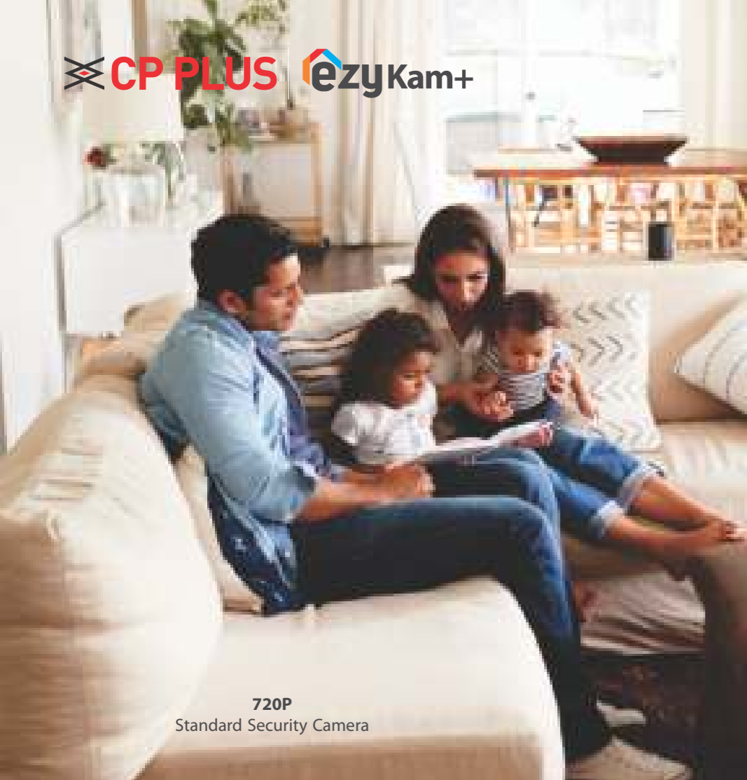
720P Standard Security Camera