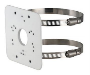
CP-UA-B2P Pole Mount