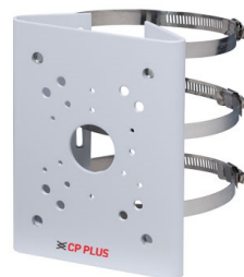
CP-UA-B3P Pole Mount