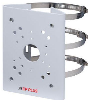
CP-UA-B3P Pole Mount Bracket