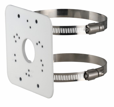
CP-UA-B2P POLE Mount Bracket