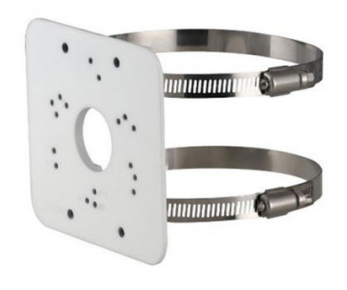
CP-UA-B2P Pole Mount