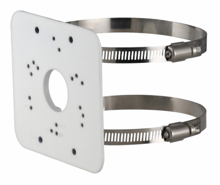
CP-UA-B2P Pole Mount Bracket