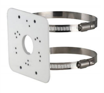
CP-UA-B2P Pole Mount