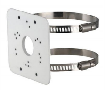
CP-UA-B2P Pole Mount