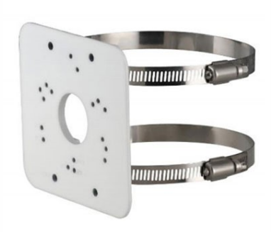
CP-UA-B2P Pole Mount